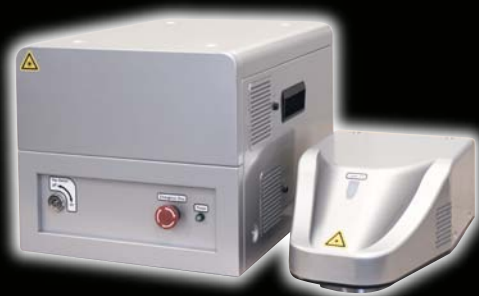
CLS-X 10W Laser Wavelength:1064nm