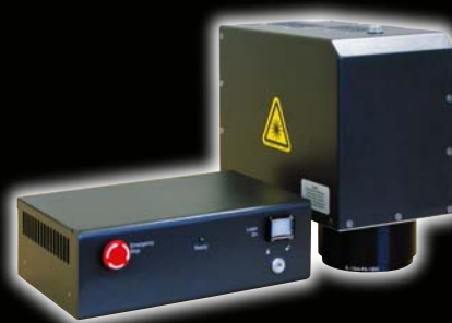
UM-1C 1W YAG Laser Wavelength:1064nm