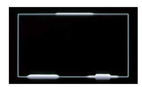
Line width variable in an instant