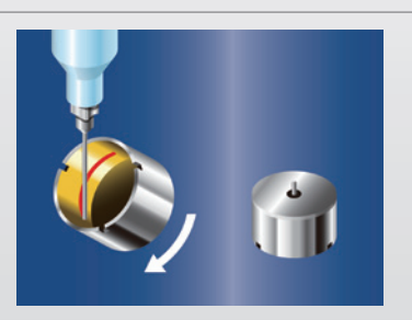
Dispensing of 2-part epoxy adhesive to motors